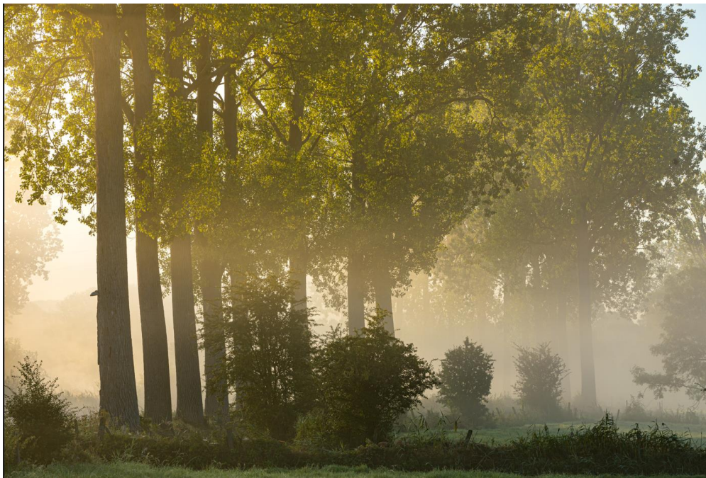
Gert Arijns 2019

Other ways to reduce the tree fellings according to the study are: stricter regulations, fewer felling permits and good communication ('what is the use of trees?'). Good communication may be important for sensitisation, but the two other possibilities are beyond the scope of this study, and we will not discuss it here.